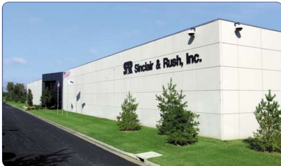
Arnold, Missouri USA Manufacturing Plant

Known as a premier supplier to other leading manufacturers, Sinclair & Rush companies continue to search for new technologies, create new materials and find applications that promote value for our customer's products.