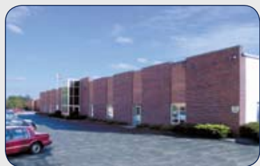
Kirkwood, Missouri USA

Software® Beverageware With Style! www.software.com