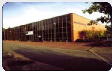
United Kingdom Manufacturing Plant